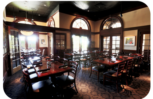
The Front Lounge